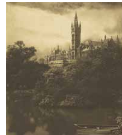
Glasgow University, 1898, by James Craig Annan.

A major exhibition will be held at the Scottish National Portrait Gallery next year.