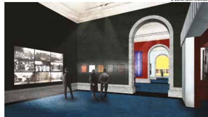
V&A Photography Centre – render of gallery 99.